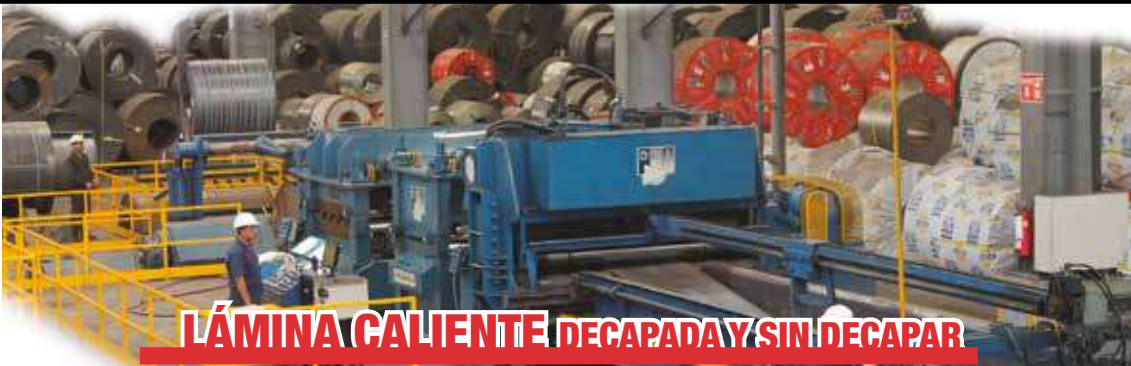
LÁMINA CALIENTE DECAPADA Y SIN DECAPAR